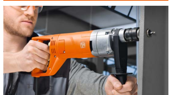
Hand-guided metal core drilling system for fast and flexible use.