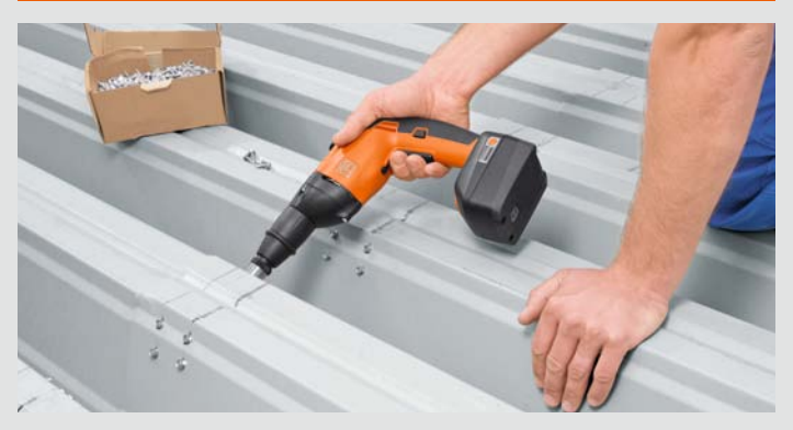
The perfect interplay of motor and high-quality battery cells ensures up to 400 screw connections per battery charge in sheet steel.