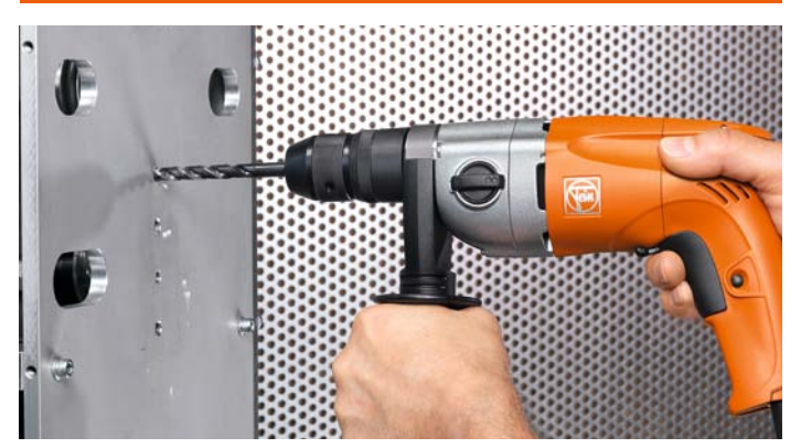
Universal two-speed drill up to 10 mm with ideal speed range for steel and stainless steel.