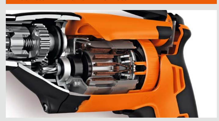
"Made by FEIN" motor quality: the brushless motor developed and produced by FEIN was designed especially for use in power tools. It guarantees a very long life and requires no maintenance.