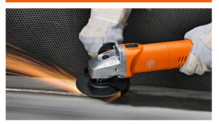
Powerful compact angle grinder for grinding and cutting work.