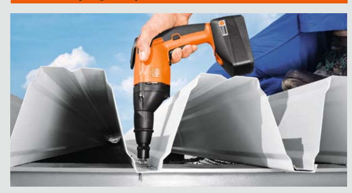
The ASCS from FEIN delivers the power required and the right speed for continuous use, making light work of even screw connections in steel girders.