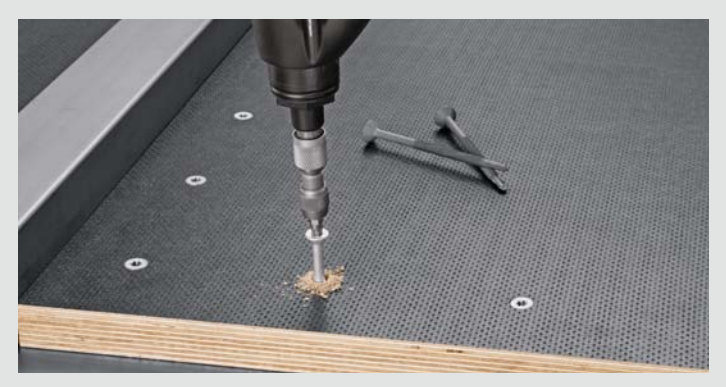
The adjustable, electronic torque shut-off ensures consistently precise screw connections – even without a depth stop. The benefit: optimum results and an unobstructed view of the screw.