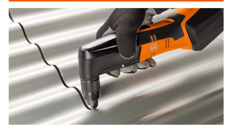
Compact and curve-compatible cordless nibbler for precise cuts in profiles, trapezoid and corrugated sheet metal.