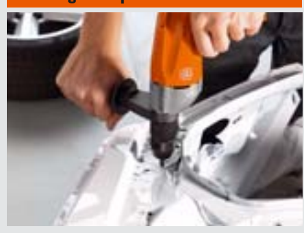
The ergonomic design makes highly accurate and effortless operation much easier.