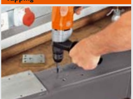
Power intensive operations such as tapping can be carried out reliably, due to the consistently high power level.