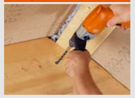
100% performance at all times and high torque for the toughest jobs using the pistol grip.