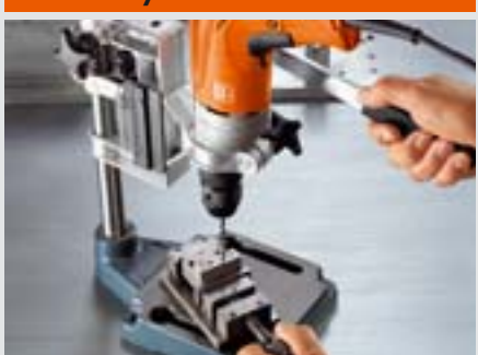
The standard clamping neck allows stationary use of all BOP power drills.