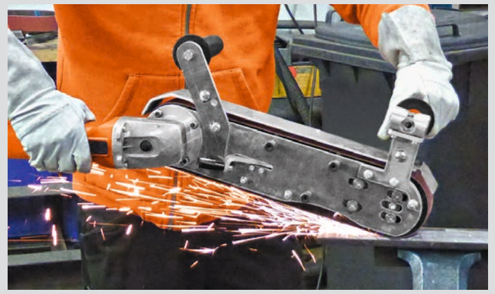
Large contact area - 31/8 in (80 mm) long

Flange-mounted motor can be rotated by almost 360°.