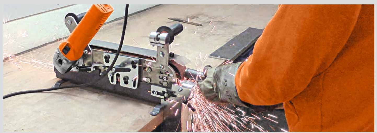
In addition to using the FEIN GHB 15-50 as a hand-held tool, you can convert it into a stationary tool in seconds. The practical, high-quality station is easy to install.