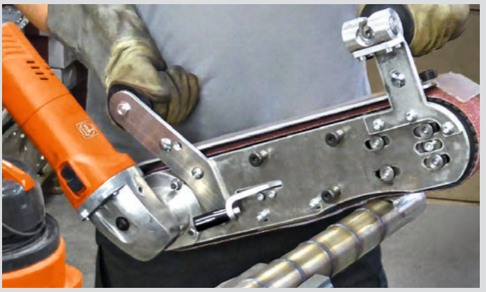
Comfortable machining of pipes and profiles