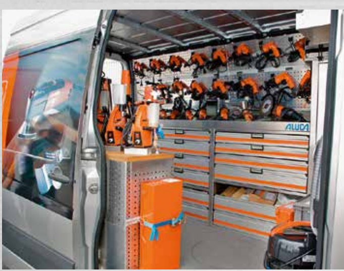
Experience the FEIN world of grinding today. Discover the entire range of FEIN cordless grinders and film at www.fein.com .

power tools. A new FEIN product simply has to be registered at www.fein.com/warranty within 6 weeks of purchase.