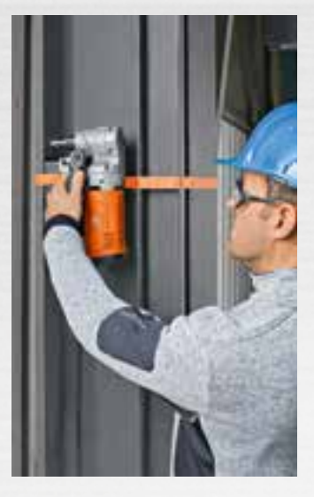
Including vertical and overhead working