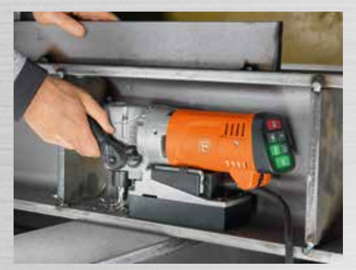
Working near edges and in tight spots

With a height of 169 mm and a width across corners of 33 mm, the FEIN KBC 35 provides convenient working near edges and with a good view of the drilling point.