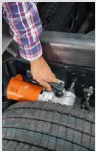
Optimum view of drilling point