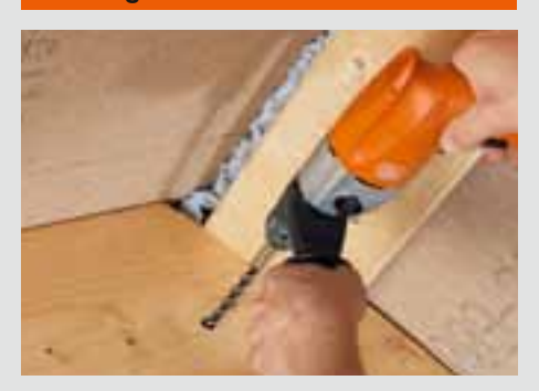
100% performance and consistent speed guaranteed for very demanding work in the power position.