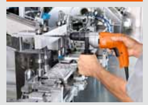
Fast work progress and optimum concentricity for high-precision jobs in the sensitive position.