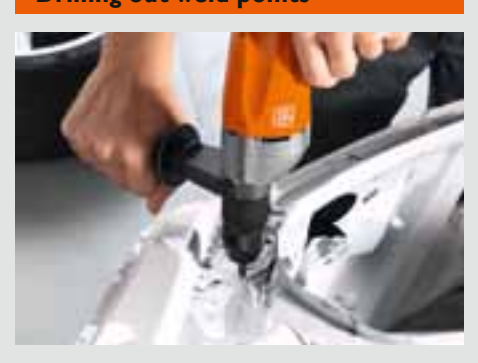
Highly accurate and fatigue-free work is greatly aided by the ergonomic design.