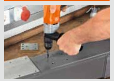
Power-hungry jobs like thread cutting can be reliably performed thanks to the constantly high energy level. (Excluding BOP and ABOP6)