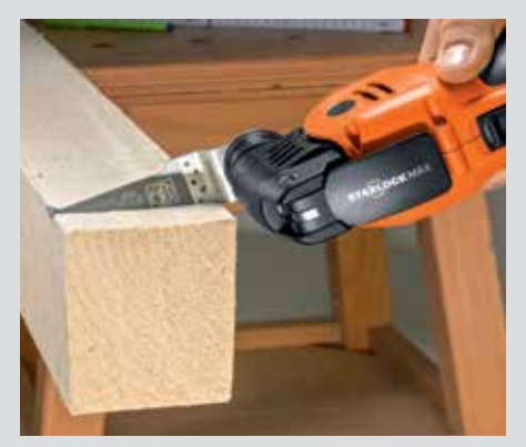
Even heavy construction lumber can be effortlessly cut to length with the SUPERCUT.