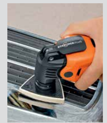
Maintain vehicles and increase value.