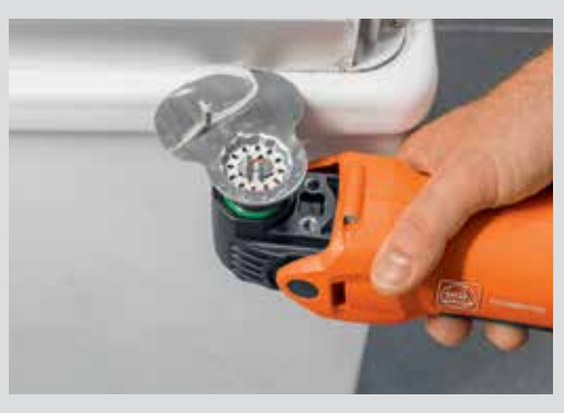
Remove connection joints.