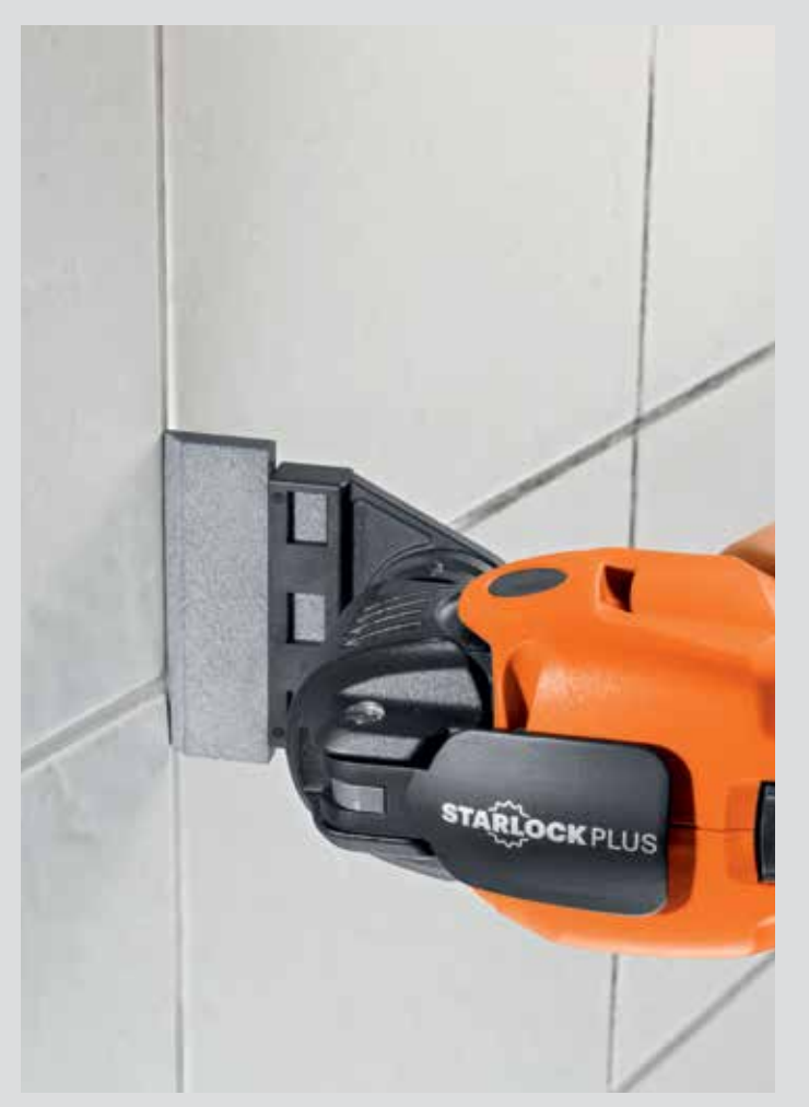
Clean soiled tile joints efficiently with minimal effort.