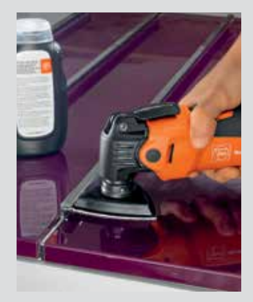
Polish high gloss surfaces.