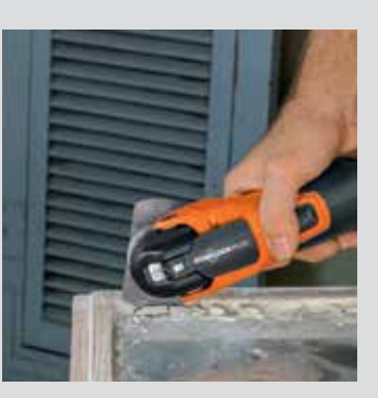
Oscillation motion eliminates risk of glass breakage.