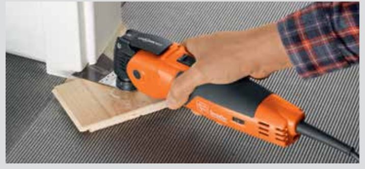
Door jamb trimming works perfectly.