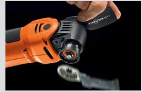
Eject the accessory and done!

Starlock. Sometimes the details make the difference. Like Starlock, the innovative tool mount, it enables an accessory change in only 3 seconds. At the same time, it guarantees perfect accessory fitting and therefore maximum power transfer. The result: even faster work performance in every application.