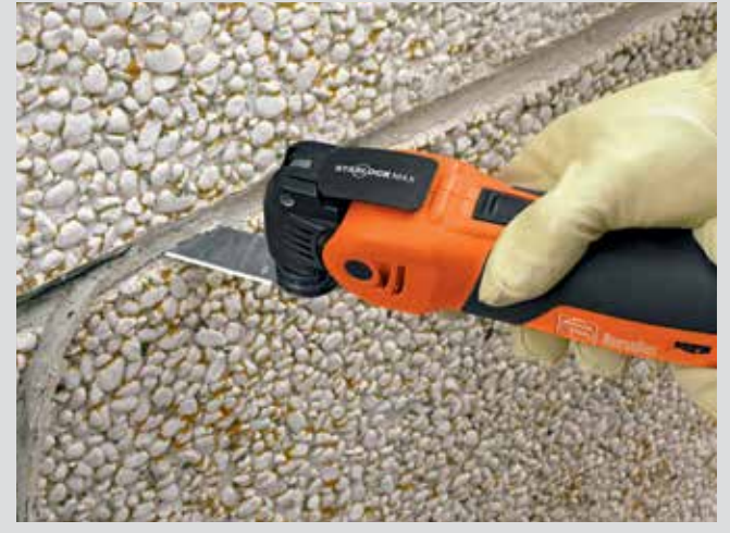
Long cutting blade for very deep joints.