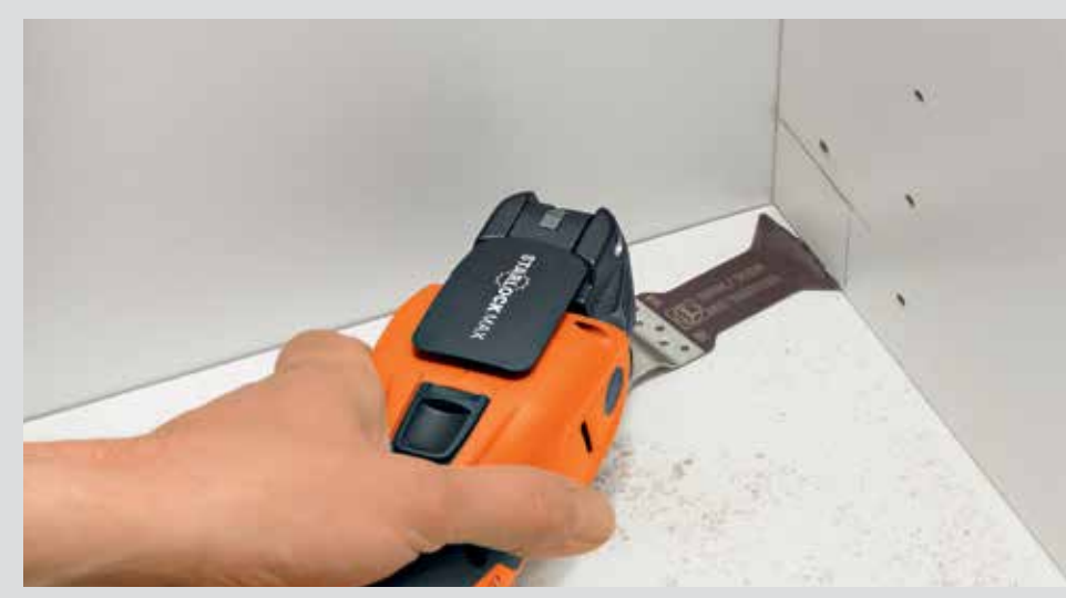
Cutouts in furniture in difficult-to-reach spots.