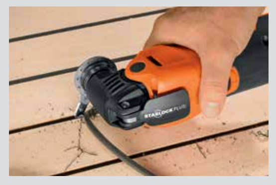
Up to 80% time savings when renewing planked teak decks.