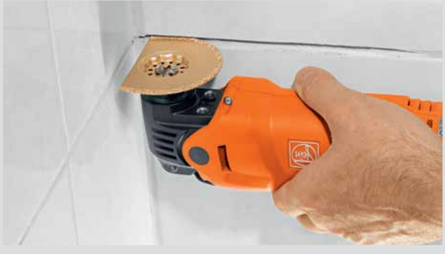
Precise results without over cuts.