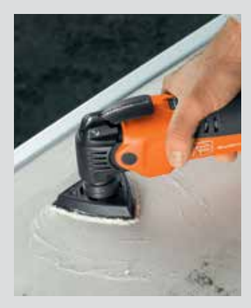
FEIN original accessories for cleaning and polishing diverse surfaces.