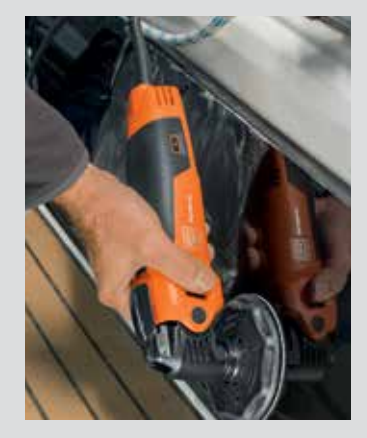
Restore acrylic and polycarbonate.