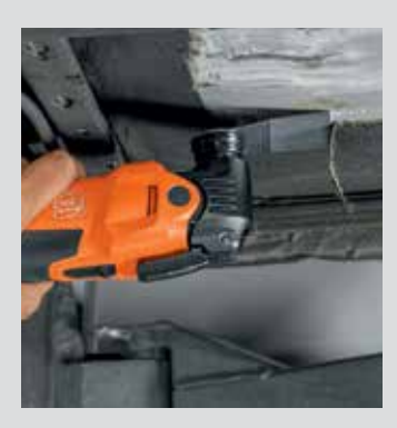
Different scraper models for a wide range of uses.