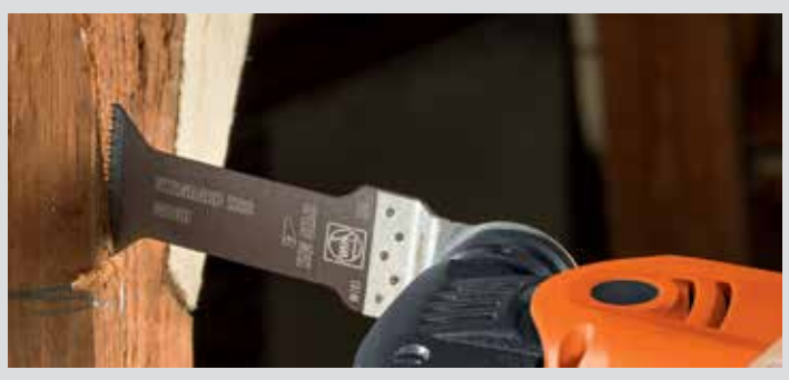
Deep cuts are made quickly and easily anywhere on site.