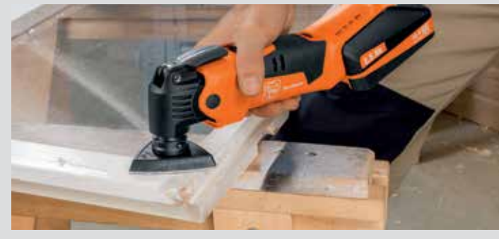
Complete window renovation - everywhere, even without outlets.