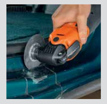
Distortion-free sawing, clean cut edges, thin cutting line – an advantage in auto body work.