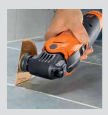
Even very small joints can be cut out with the narrow, 3/64 in (1.2 mm) saw blades.