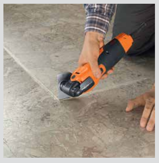
Maximum service life with diamond accessories.