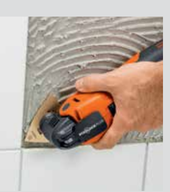
Remove tile adhesive with rasp.