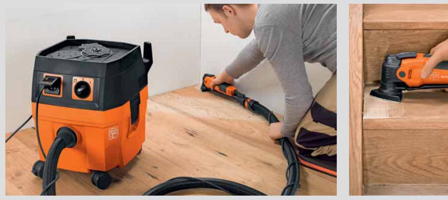
With or without dust collection - great time savings, even with large surfaces.