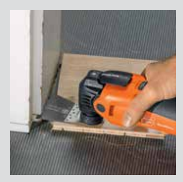
Work flush with the surface.