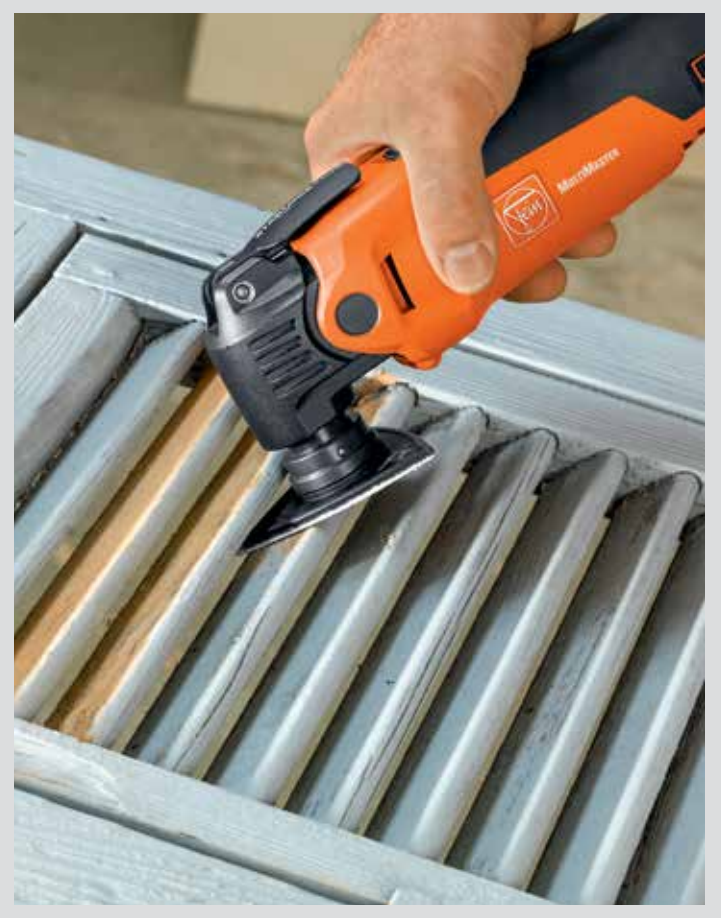
Flat backing pad for tight spaces.