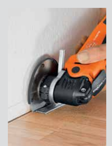
Precise work close to edges, even with depth stop.