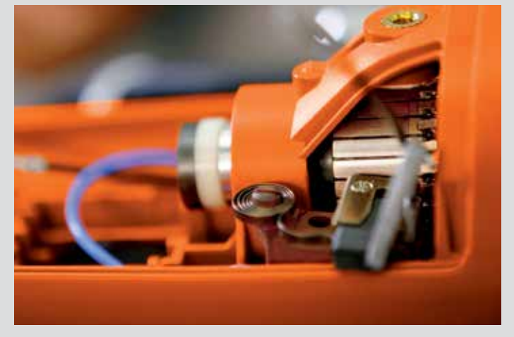
The first Original: The 1967 FEIN saw with oscillating saw blade.

Striving to make enduring power tools - Made in Germany - remains our focus. And when these products are trusted millions of times throughout the world over the decades and this trust is justified in every situation - Originals emerge.