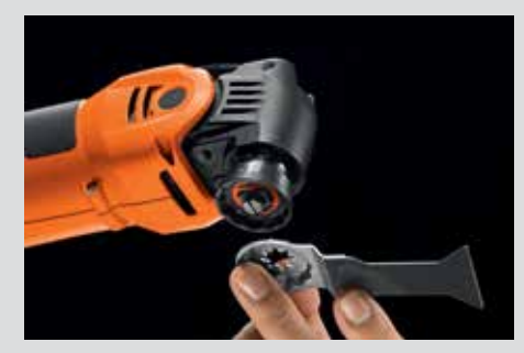
Simply position the accessory in the Starlock mount and snap into place.