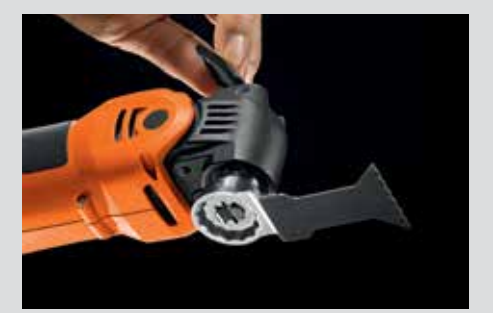
To release, lift the locking lever.