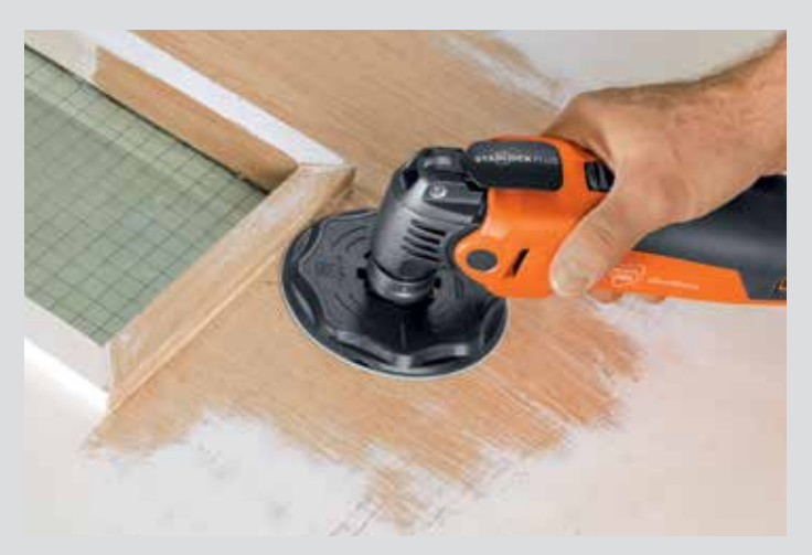
The large sanding disc replaces additional sanding machines such as random orbit or pad sanders.