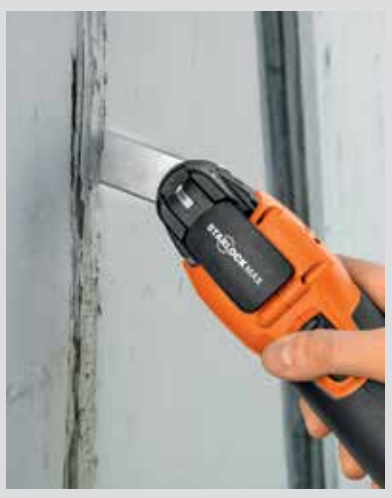
Removal of flexible joint sealants in above and below-ground construction.