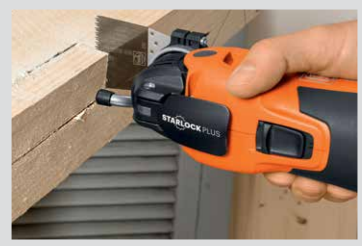
Adequate power for all requirements.