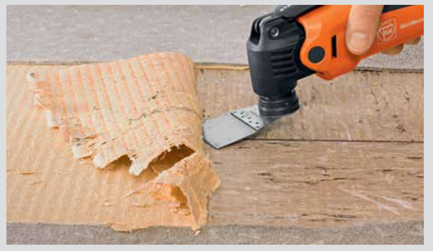
Remove old floor coverings quickly, easily and completely.