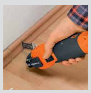
No clearance required behind the workpiece.