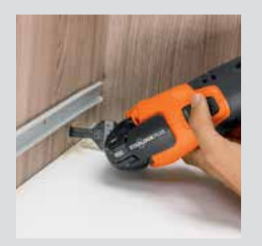
The smallest cutouts, 3/8 in (10 mm) and larger.