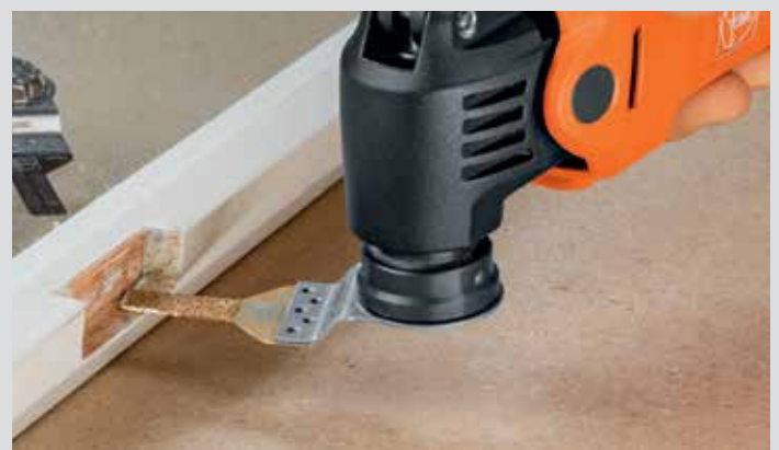
Smooth cut-outs neatly and precisely.