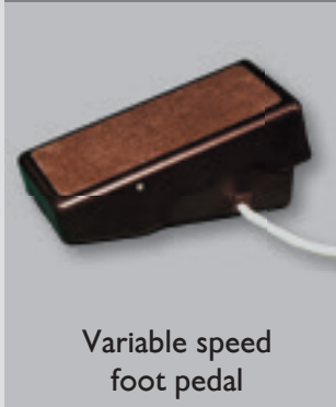
Variable speed foot pedal