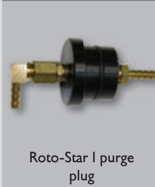
Roto-Star I purge plug