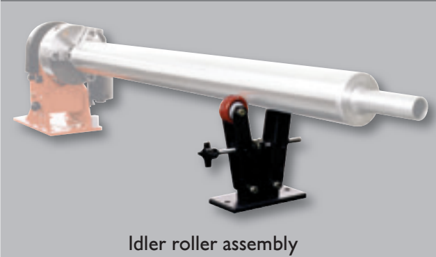
Idler roller assembly