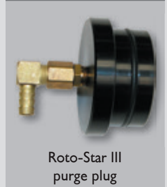
Roto-Star III purge plug