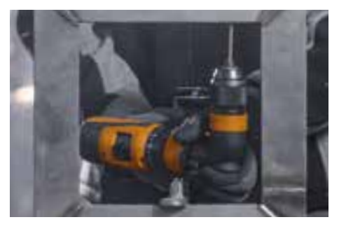
Angled head Metal angled head for drilling, tapping and screwdriving in confined spaces. All FEIN QuickIN accessories such as drill chucks, bit holders or socket adapters can be attached to the angled head.