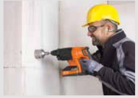
Drilling Produce 68 mm socket holes in masonry.