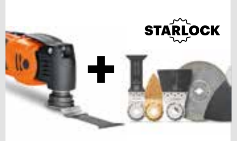
Maximum, systematic power The innovative Starlock system provides maximum precision, maximum work progress and perfect results when mounting tools.

QuickIN Patented tool-free FEIN rapid clamping system. When combined with Starlock, it safely and conveniently delivers the fastest tool change in less than 3 seconds.