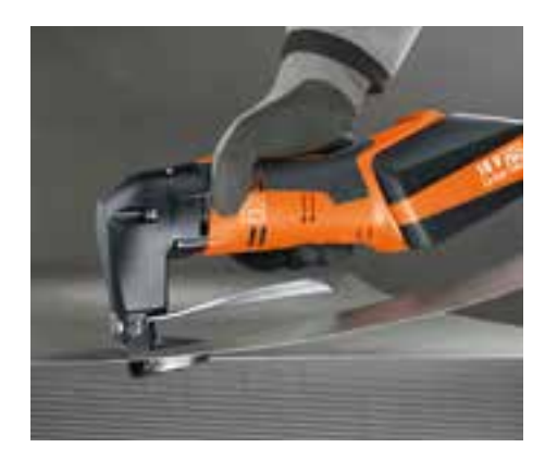
Efficient and reliable Sheet metal shears operate very efficiently and with no material loss at cutting speeds of up to 8 m/min.