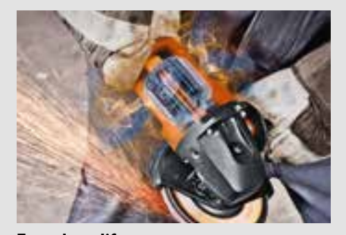
For a long life The latest generation of brushless FEIN POWERDRIVE MOTORS is fully encapsulated, lowwear and requires no maintenance.

Additional product variants and information: page 28 and at fein.com