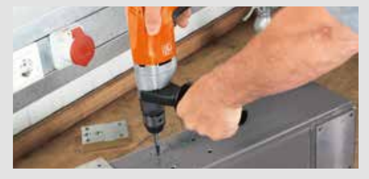
Ideal for drilling in metal and tapping Fast work progress and optimum concentricity for high-precision jobs in sensitive positions.

Additional product variants and information: page 33 and at fein.com