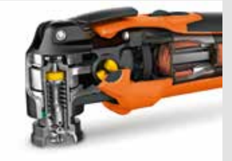
FEIN anti-vibration system Self-supporting motor with full separation from the housing provides effective reduction of vibrations. For safe working and minimum physical strain.