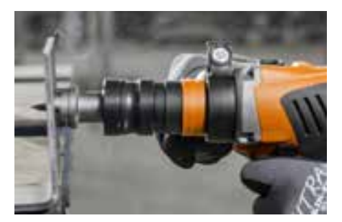
Hole saw adapter

Thanks to the QuickIN interface, users can change between all drilling and screwdriving applications quickly and without having to use tools. Perfectly matched to the respective tasks, FEIN QuickIN accessories are more reliable and precise than standard solutions.