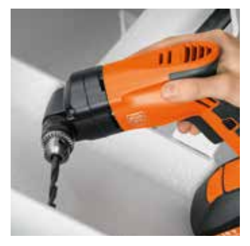
Problem-solver tor tight spots Angle drill with minimum dimensions for confined and hard-to-reach spaces.