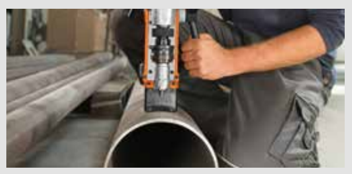
Use with pipes The magnetic contact faces have the shape of a prism. This ensures a secure hold, even when core drilling on pipes with a diameter of between 80 and 250 mm.

Extra narrow permanent magnet with magnetic bias enables simple and flexible alignment of the tool to the workpiece – including vertical and overhead alignment.