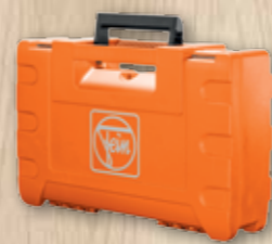
Customised kit in plastic carrying case