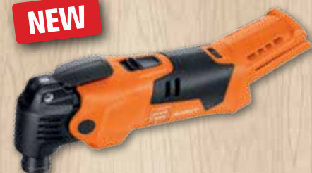
Choose any FEIN Cordless Tool