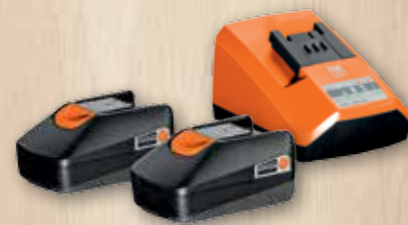
Add Battery Starter Set (charger + 2 x 18V 4Ah Batteries) $329 | 92604302020